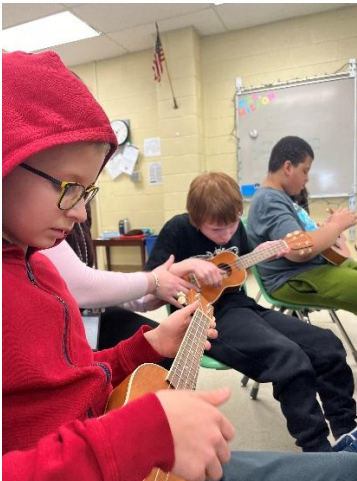
Creating on Ukuleles