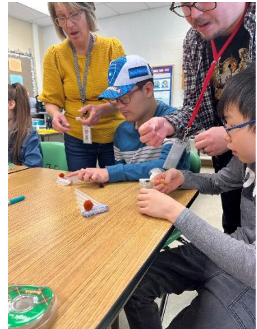
Students Making Pan Flutes from Boba Straws